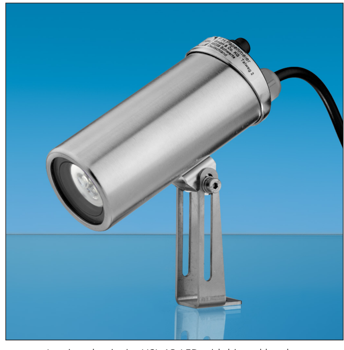
Lumistar luminaire USL 13-LED with hinged bracket