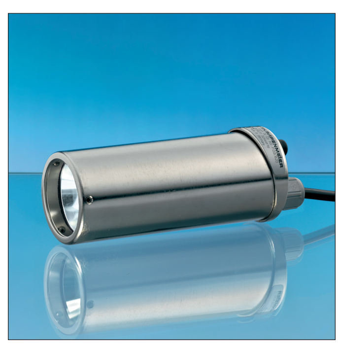
Lumistar luminaire USL 33-LED