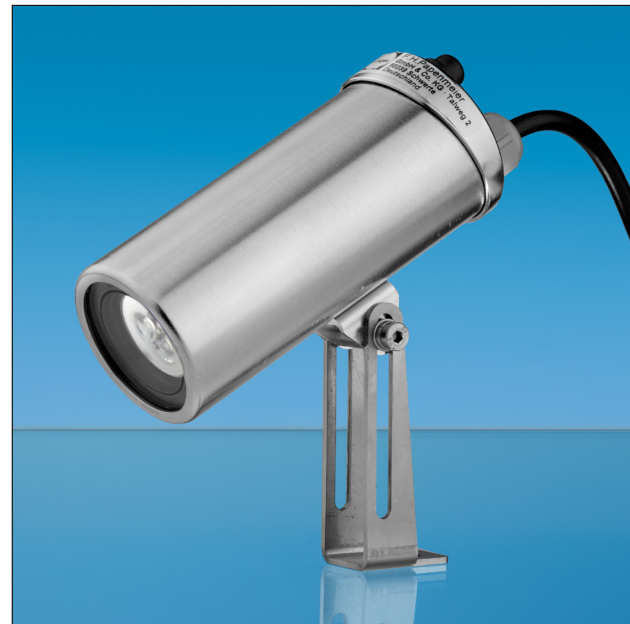
Lumistar luminaire USL 13-LED with hinged bracket

The luminaire is mounted over a special circular collar or connecting piece on the cover flange and secured in place. An O-ring is inserted as a seal for the sight glass. A tried-and-tested alternative is to mount the luminaire using an adapted clamped similar to DIN 32676/ISO 2852. The tapered mating flange to the nozzle clamp flange forms a special ring construction with a concentric sight glass fused into the metal and an upstand with a groove for the O-ring on the outer surface.