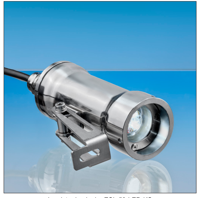
Lumistar luminaire ESL 53-LED-KS with hinged bracket