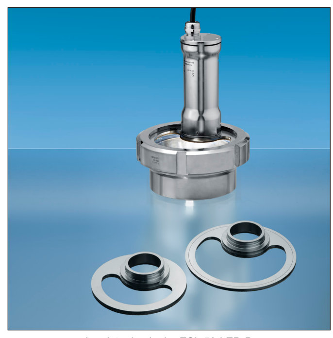
Lumistar luminaire ESL 53-LED-B mounting on a screw-type sight glass fitting according to DIN 11851 or similar