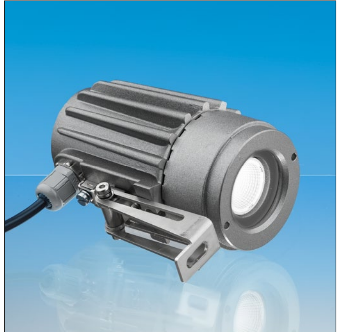
Lumistar luminaire USL 05-LED