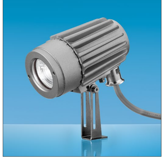
Lumistar luminaire USL 05LED-Ex