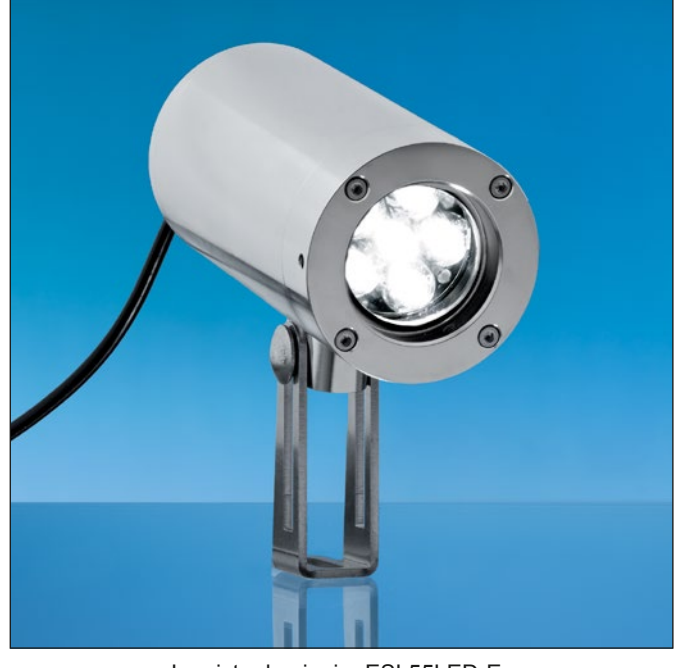
Lumistar luminaire ESL55LED-Ex