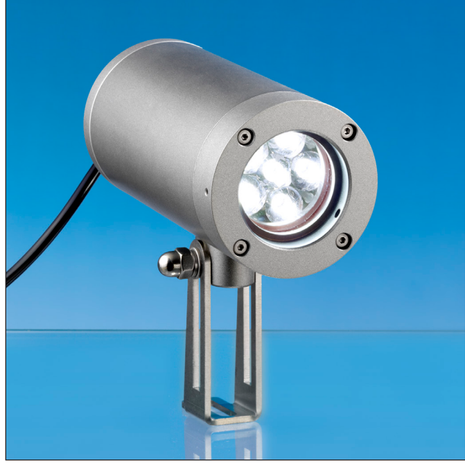
Lumistar luminaire ASL55LED-Ex