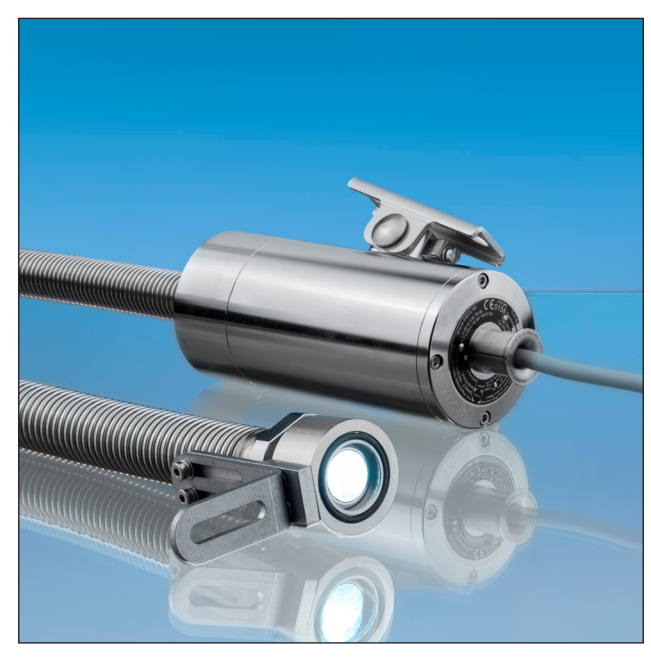
Lumistar luminaire 'Lumiflex' ESL55LED-ALF-Ex

The ferrite core included in the scope of supply should be used with connecting variants b and c. All connection wires need to be wound a full turn around the core. In the case of the 24 V variant, the ferrite core should be slid onto the cable at a distance of around 10 mm from the cover.